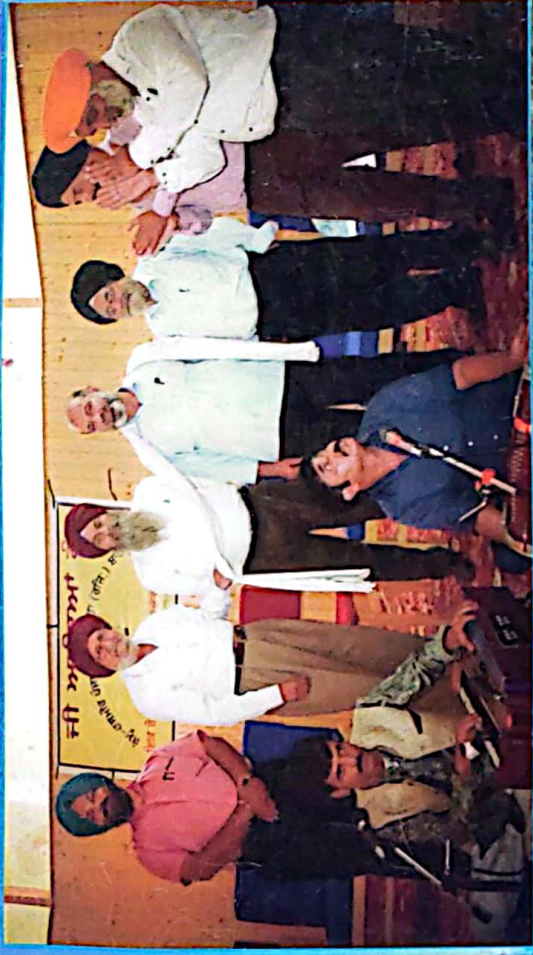
One Day Literary Cultural Meet Organized By J.K Peoples Sant Sabina Baramulla